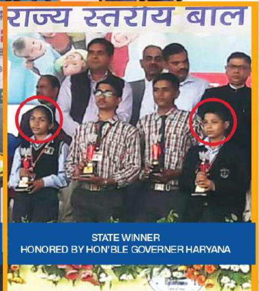
STATE WINNER HONORED BY HON'BLE GOVERNOR HARYANA