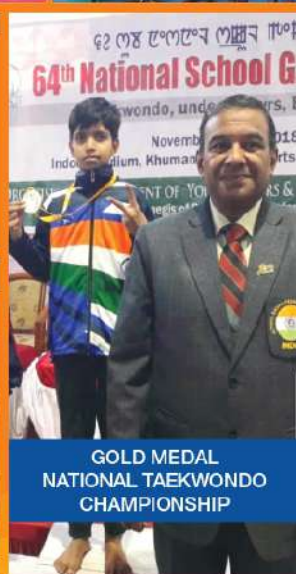
GOLD MEDAL NATIONAL TAEKWONDO CHAMPIONSHIP